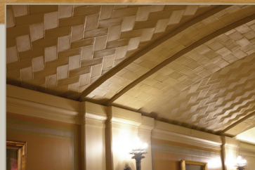
Minnesota State Capitol Interior Renovations Saint Paul, MN

Category Masonry Restoration • Commercial