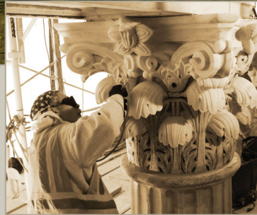
Minnesota State Capitol Exterior Marble Restoration Saint Paul, MN

Category Masonry Restoration • Commercial