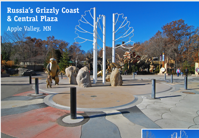
Russia's Grizzly Coast & Central Plaza Apple Valley, MN

Category: Concrete - Commercial Decorative Owner: Minnesota Zoological Gardens Architect: The Portico Group General Contractor: Mortenson Construction Concrete Contractor: Bulach Custom Rock, LLC