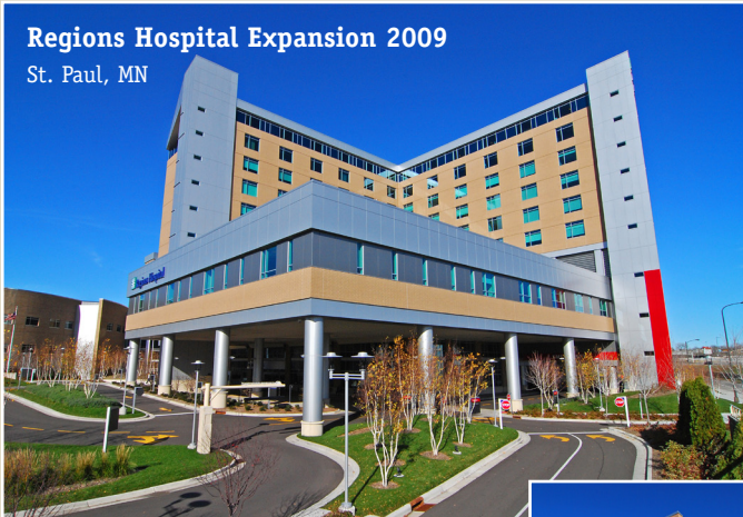
Regions Hospital Expansion 2009 St. Paul, MN

Category: Masonry - Commercial Cast Stone Owner: Regions Hospital Architect/Designer: Ellerbe Becket Inc. General Contractor: Kraus-Anderson Construction Company Masonry Contractor: Northland Concrete & Masonry Company, LLC