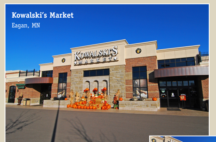
Kowalski's Market Eagan, MN Category: Masonry - Commercial Retail Owner: Diffley 35, LLC Architect/Designer: Harriss Architects, Inc. General Contractor: EFH Co. Masonry Contractor: Northland Concrete & Masonry Company, LLC