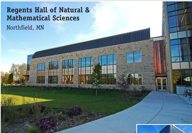
Regents Hall of Natural & Mathematical Sciences Northfield, MN

Category: Masonry - Set Stone Owner: St. Olaf College Architect/Designer: Holabird & Root General Contractor: Oscar J Boldt Construction Masonry Contractor: Serice Construction, Inc.