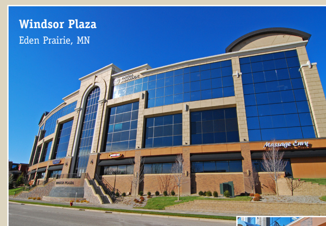
Windsor Plaza Eden Prairie, MN Category: Masonry - Commercial Office Owner: Solomon Real Estate Architect/Designer: Cluts, O'Brien, Strothers Architects General Contractor: Amcon Construction Masonry Contractor: Northland Concrete & Masonry Company, LLC