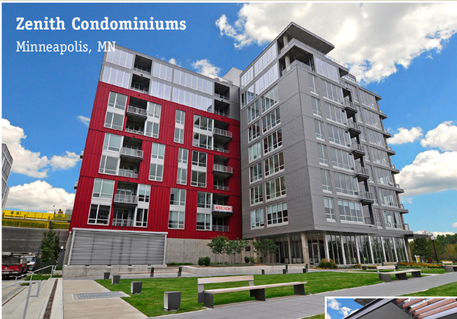
Zenith Condominiums Minneapolis, MN

Category: Concrete - Residential Owner: Sherman Associates Architect: Elness Swenson Graham Architects, Inc. Structural Engineer: Meyer Borgman and Johnson, Inc. General Contractor: BOR-SON Construction, Inc. Concrete Contractor: BOR-SON Construction, Inc.