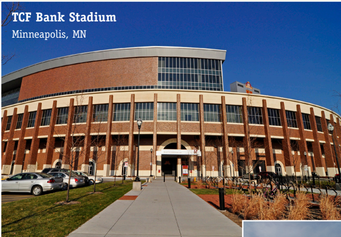
TCF Bank Stadium Minneapolis, MN

Category: Masonry - Commercial Institutional Owner: University of Minnesota Architect/Designer: Populous General Contractor: Mortenson Construction Masonry Contractor: Northland Concrete & Masonry Company, LLC