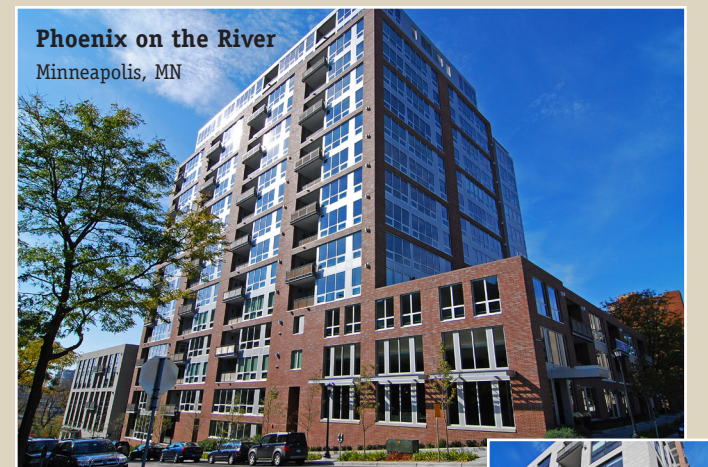
Phoenix on the River Minneapolis, MN Category: Masonry - Residential Owner: Schafer Richardson Architect/Designer: Elness Swenson Graham Architects, Inc. General Contractor: BOR-SON Construction, Inc. Masonry Contractor: B & D Associates, Inc.