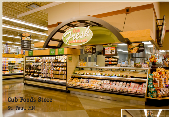
Cub Foods Store St. Paul, MN Category: Concrete - Industrial Owner: Oppidan Inc. Architect: Store Design Services General Contractor: Kraus-Anderson Construction Company Concrete Contractor: Bulach Custom Rock, LLC