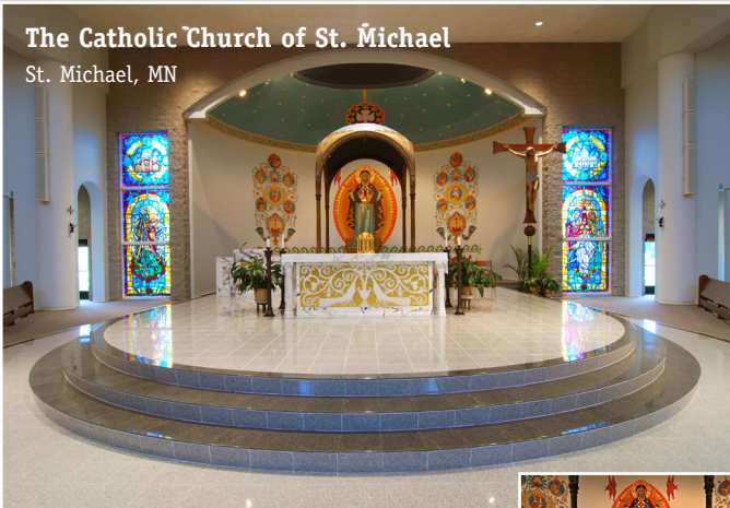
The Catholic Church of St. Michael St. Michael, MN

Category: Masonry - Commercial Religious Owner: St. Michael Catholic Church Architect/Designer: Williams/O'Brien Associates, Inc. General Contractor: Mortenson Construction Tile Contractor: Twin City Tile & Marble Company