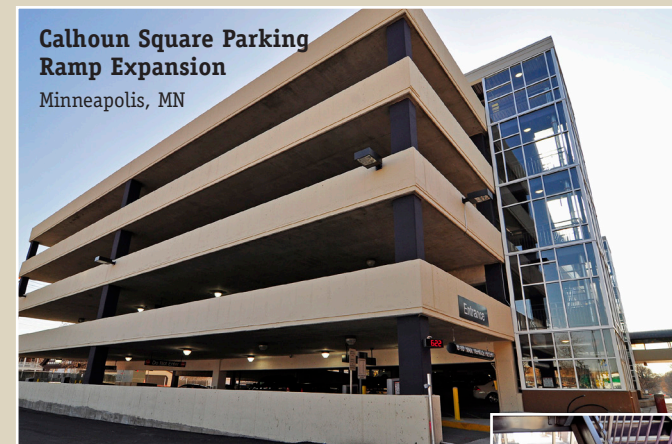
Calhoun Square Parking Ramp Expansion Minneapolis, MN Category: Concrete - Commercial Functional Owner: ROF Calhoun Square, LLC Architect: RSP Architects Structural Engineer: Walker Parking Consultants General Contractor: Kraus-Anderson Construction Company Concrete Contractor: Northland Concrete & Masonry Company, LLC