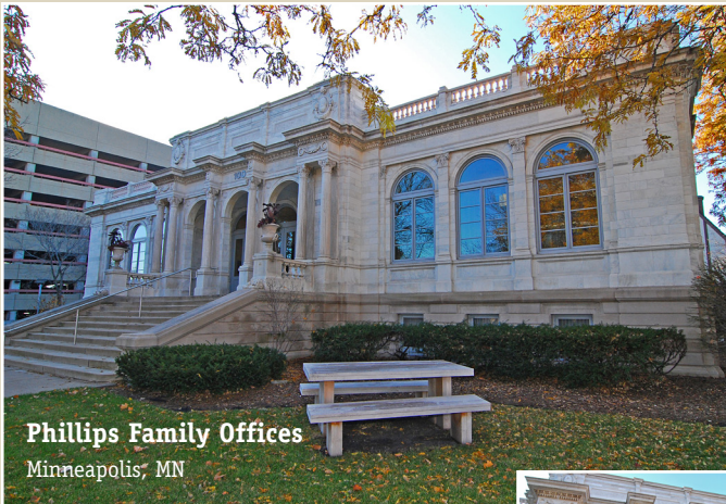
Phillips Family Offices Minneapolis, MN

Category: Masonry - Commercial Restoration Owner: The Phillips Family Architect/Designer: Domain Architecture & Design General Contractor: Ryan Companies US Inc. Masonry Contractor: Advanced Masonry Restoration