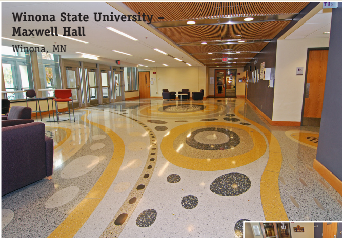
Winona State University - Maxwell Hall Winona, MN

Category: Masonry - Commercial Tile and Terrazzo Owner: Minnesota State Colleges & Universities Architect/Designer: Holabird & Root General Contractor: Merrimac Construction Company Inc. Tile Contractor: Grazzini Brothers & Company